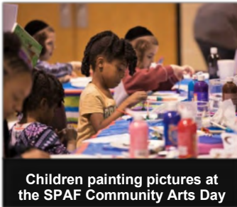
Children painting pictures at the SPAF Community Arts Day

The Community Arts Day was held on April 22 at the Mary Ryan Boys & Girls Club. Over 100 families, friends, and neighbors, most from the Sherman Park area, were in attendance. Attendees visited various stations led by artists, all of whom live or work in the Sherman Park community, to enjoy arts and crafts ranging from Asian fan making to drawing zentangle patterns. They also worked from an artist-created lesson plan to create artwork that illustrated and celebrated our diversity and commonalities.