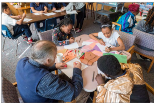
Project: VITAL: Students from St. Catherine's Catholic Elementary School working with seniors at Capitol Drive Lutheran Church's Senior Center

n'roo-akh/ a Hebrew word meaning spirit, wind, or breath